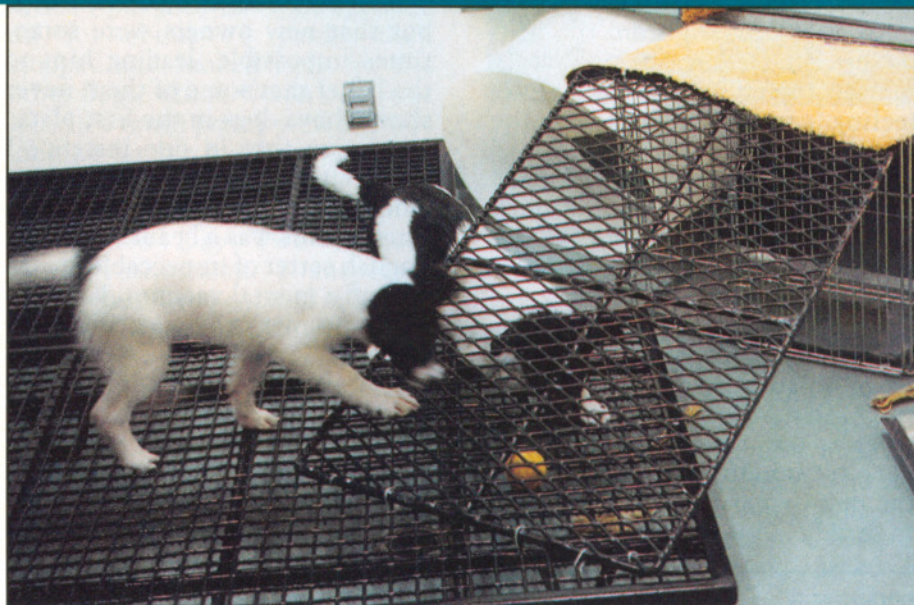
A detour problem is solved by one pup and pondered by the other, who will also solve it in a day or two.

At first there are mistakes. Pup may stumble, trip over nothing, get one foot or two moving at the wrong time...in other words, a klutz. Nothing like the elegant bird-finder one hopes for. Even at four months, many pups are still gawky, ungainly, and foot-plopping clumsy. The road from the four-week-old stumbler to finished elegance is paved with practice, pushing the muscles and their