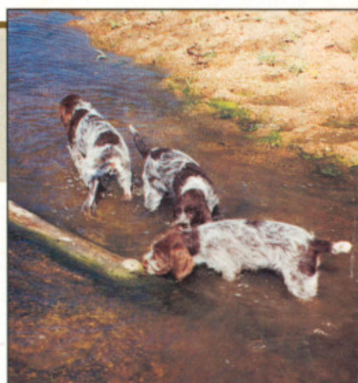
Trips to the field are most important, where investigation of everything by all possible modalities helps make pup a brilliant dog.

In the sterile four walls, wire or wood or cement block rearing kennels we use with only mom and