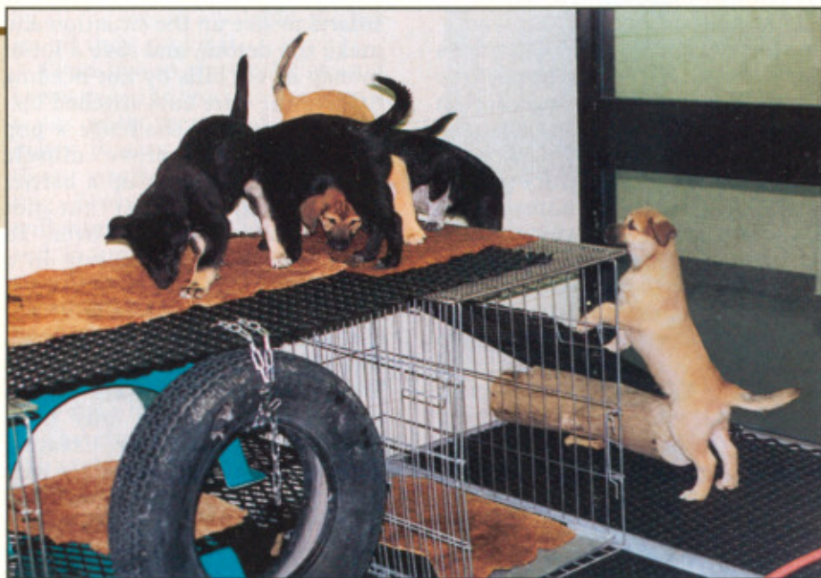
These pups are having a great time climbing a see-through ramp to a see-through bridge in an environment enriched with a variety of playground apparatus.

At least equally, or even more so, they need a mentally challenging environment. They need to develop problem-solving ability, mental agility and mental coordination. They are not going to get it unless the breeder provides the opportunity. The restricted brain and neuron development that