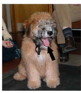
Relaxed, happy dog.