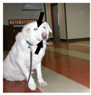
Mouth closed, intense, warning expression