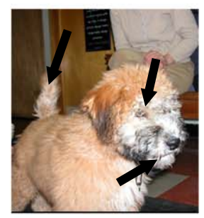
Mouth closed, tail up, intense expression.