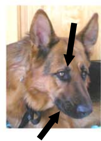
Mouth closed, intense stare.