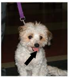
Happy expression, relaxed body position.