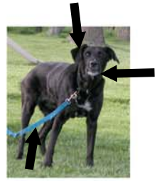
Tied up, on guard.