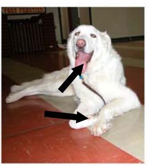
Relaxed, paw tucked.