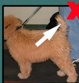
Tail up in the air